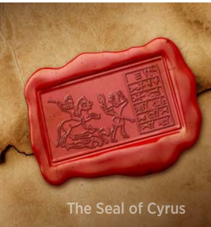
The Seal of Cyrus